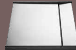
Applicable drip tray