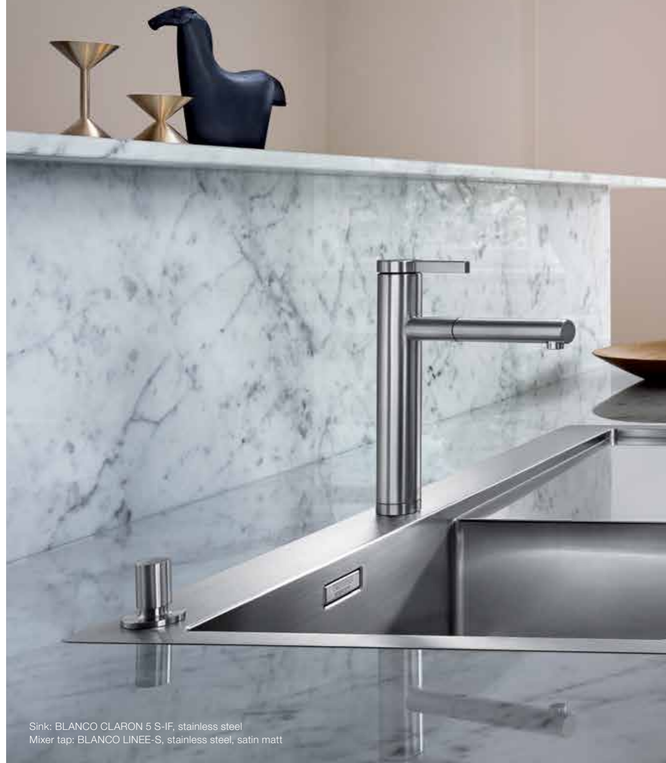
Sink: BLANCO CLARON 5 S-IF, stainless steel Mixer tap: BLANCO LINEE-S, stainless steel, satin matt

Our ambition? To always exceed our own achievements.