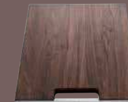
Wooden chopping board

Discover the full range at a specialist store or on our website