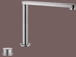
BLANCO ELOSCOPE-F II