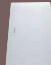
Glass chopping board